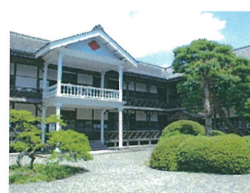
③ Tome City/ Meiji Village