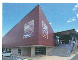
② Kesennuma City/ Sea Market, Umi-no-ichi