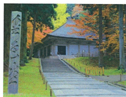
① Iwate Prefecture/ Chusonji Temple Golden Pagoda